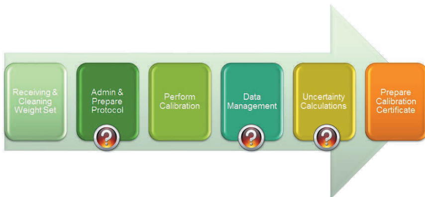
Figure 1. Manual process for weight calibration indicating steps with highest risk of error

Ongoing reliability for these custom systems may also be called into question for various reasons including low data security and the amount of training required for new personnel. Custom systems also typically lack an ability to interface with the comparator balances or other lab equipment. As such, the most significant source of error in any calibration process—manual data transcription—is not addressed or eliminated [Figure 1]. If data is only stored on paper, statistical analysis and historical reporting becomes difficult if not impossible.