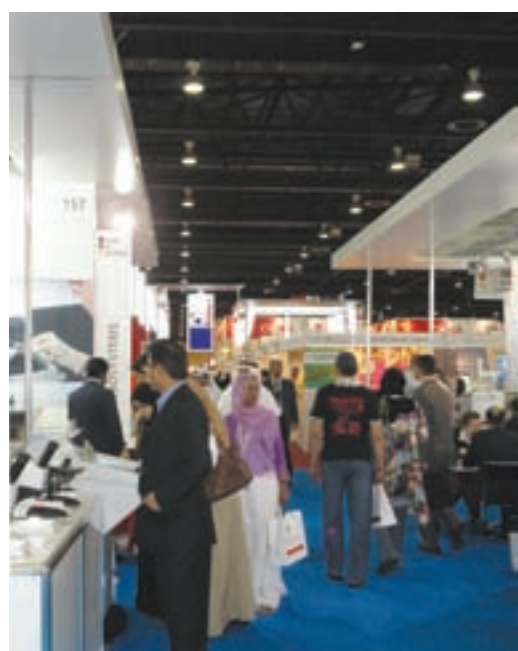
Figure 5. Leica Microsystems and the German Pavilion

microscopes and microscopy accessories on show, and a lot of business and demonstrations seemed to be taking place across the stand. This is of course not to say that the other companies were not busy, in fact far from it, but possibly the Leica Microsystems stand being the most imposing, maybe. Across the pavilion other companies had a good report of traffic including Hirschmann Laborgerate showing many types of liquid handling and transfer materials. Other companies that I had spoken to also reported to have a very good show and well beyond their expectations.