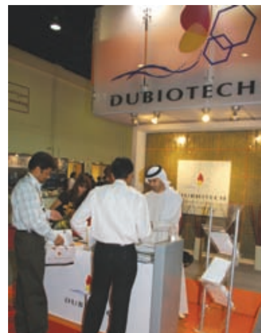
Figure 8. DuBiotech, an imposing stand for an imposing project.

coast of the Arabian Gulf and will house research laboratories, small to medium sized manufacturing plants, schools, universities, shopping centres, residential areas, mosques, churches, conference facilities and hotels, amongst other things. The DuBiotech team held various presentations during the week showing their proposed facilities and what could be possible with backing. Their vision is without question remarkable and had everyone talking at the show that went to see the presentations or went round the stand to talk to people (Figure 8). The figures that are mounting up are extremely impressive as well. Prior to any above ground building work taking place, or any of the large blue-chip organisation coming in with proposals, 15% of the 2,127,735 sq ft of Manufacturing space and 21% of the 5,369,092 sq ft of Research and Development space has been leased, and over 2,000 job applications and CV's have been posted on the recruitment database from skilled employees and graduates from the Asian subcontinent and the Middle East (figures correct at the 14.02.2007 press conference). For those companies who are thinking of moving to the Middle East or getting closer research links with Asia, a quick tour of the DuBiotech facilities and entire economical and strategic set up is well worth the trouble of finding and reading.