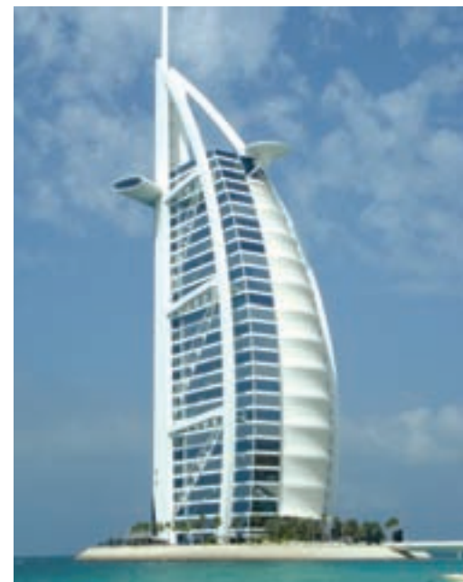
Figure 1. Burj al Arab, the only 7* star hotel in the world, also a prominent landmark in Dubai.

So where to start... well 2007 saw the 24th Arablab show appear in the city of Dubai, and also it is no coincidence that this was also the largest show to date. With the number of stands and companies that exhibit increasing over last years total by 9% to 756 companies from 47 countries, the number of visitors increasing by 11% to 9,200 from last years 8,300, and the increased size of the Technical Programme. These were not the only changes though. This year there was an increase in the advertising for the show, a huge increase in patronage and publisher partner systems, and moreover there was a high increase in the number of country stands or pavilions that were