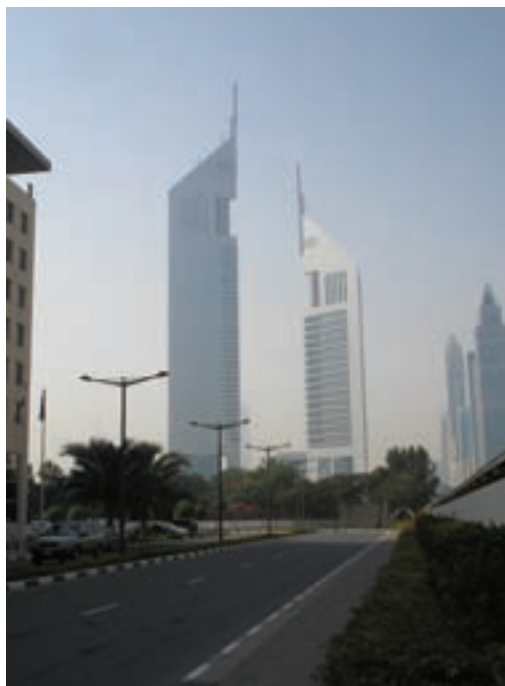
Figure 2. The Emirates Towers and a view down towards Dubai city centre.

present. One could say that this is now a truly global show that is fundamentally at the centre of the commercial world with the Asian Pacific and Indian Sub-Continent less than four hours away to the East, and the far side of Western Europe (the UK for example) just six and a half hours away to the West. This year saw pavilions from the UK, Germany, Switzerland, Austria, France, Spain, Korea and China, along with companies from all other corners of the globe taking stands on their own, along with the addition of sub sections of the show, being: MediLab, BioLab, EnviroLab and PetroLab, especially for the needs of the purchasers or workers in that industry.