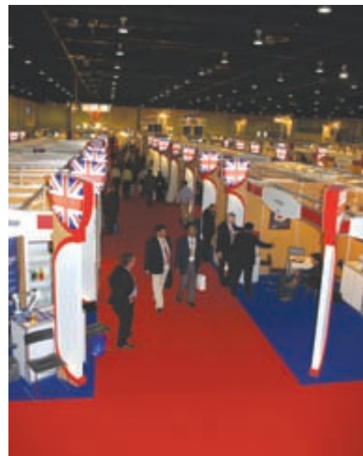
Figure 7. The UK Pavilion was the largest seen in ArabLab's history, and is looking to get bigger next year.