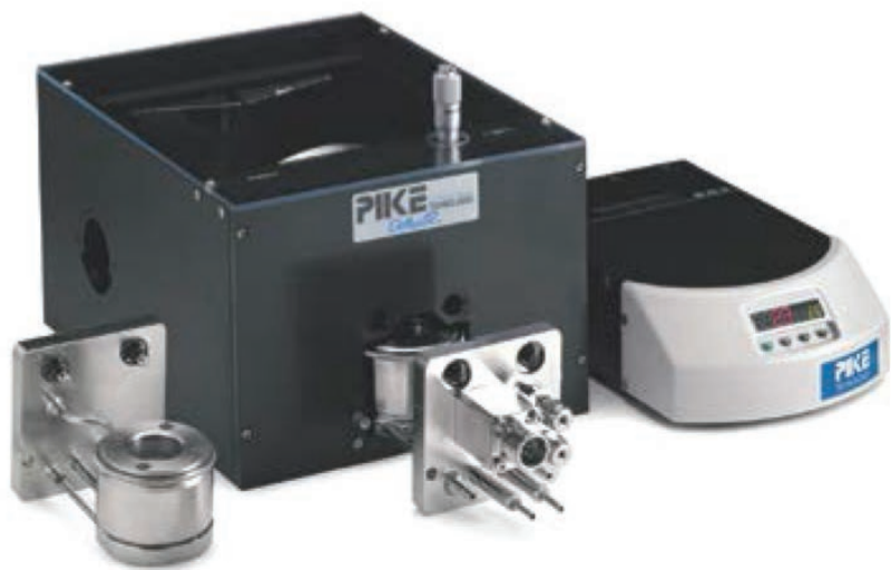
Figure 1. PIKE DiffusIR diffuse reflection accessory

The FT-IR spectra were recorded by averaging 32 scans with a resolution of 8 cm -1 . Using the heated environmental chamber inserted into the DiffusIR diffuse reflection sampling accessory (Pike Technologies; Madison, WI), the environmental chamber was flushed with synthetic air at a flow rate of ca. 20 mL/min and heated at a rate of 20°C/min up to a temperature of 550°C. Prior to the thermal treatment, the Sn(NMe 2 ) 4 was deposited on dehydrated SiO 2 using a grafting technique under static vacuum.