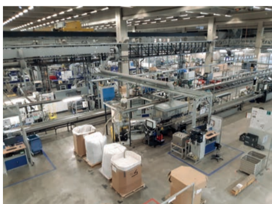
Extrusion line at Hauff-Technik in Hermaringen

Hauff-Technik is one of the world's leading manufacturers of cable, pipe, and line bushings. We are a good example of what we call 'Mittelstand' in Germany, mid-sized companies from the manufacturing industry, which are often global market leaders. Hauff-Technik is a hidden champion in that sense - yet also literally - as our products disappear into the concrete foundation when a house is built. Our products are made from polymer pellets supplied from the chemical industry that are fed into our extruders and injection molders in large quantities.