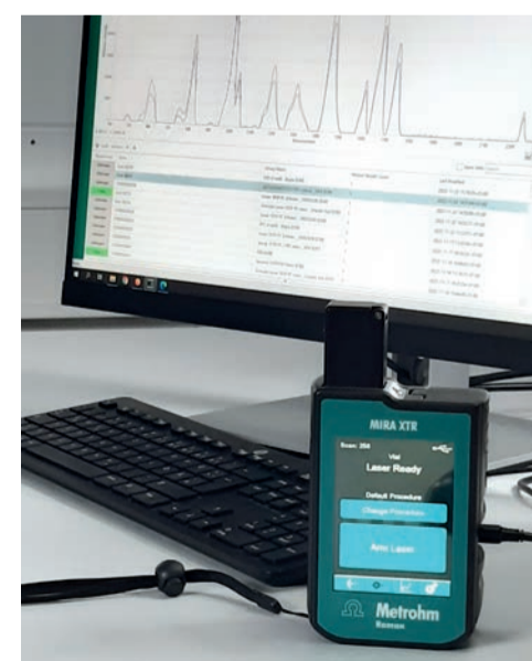
MIRA Cal Software can extract a clear Raman signal even from coloured and black polymers.

Absolutely. You see, this requires some thinking outside the box. On one hand, investing in a QC laboratory often means too much of an overhead for a small or mid-sized company. On the other hand, these days you simply cannot afford to take risks when it comes to the integrity of your products, and ultimately your brand. With handheld Raman spectroscopy you can have your cake and eat it too, as it were: Instant chemical analysis and accurate results for your QC parameters at reasonable costs - without any laboratory needed!