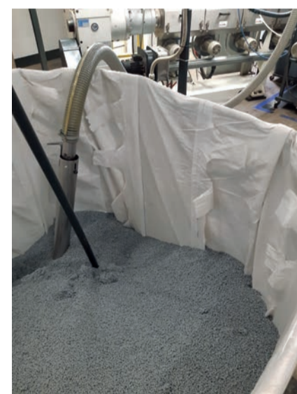
Polymer pellets are fed to one of Hauff-Technik's extruders in Hermaringen.

You see, that is the cool thing about MIRA XTR. We can extract a clear Raman signal even from the black polymer pellets that we process. What makes the difference is the XTR™ algorithm available in the MIRA Cal software, which is part of the MIRA XTR package. What is just a blurry slope before XTR is applied becomes a clear and unique fingerprint in the software thanks to the XTR algorithm. This fingerprint can then be matched against the spectrum of that particular polymer in the library of MIRA XTR for instant, unambiguous identification.