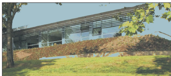
Figure 1. Exterior of AstraZeneca Conference Centre