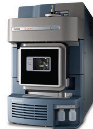
The Waters Xevo® TQ-S micro

The second that Omics LLC's PetroOrg Petroleomics Software is now available for Waters® SYNAPT® G2-Si. The combined solution delivers time saving performance, enhanced results and comprehensive data for chemical composition characterisation of petroleum.