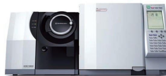
The Shimadzu GCMS-TQ8040 Mass Spectrometer

GCMS-TQ8040 Mass Spectrometer with Smart MRM - featuring Smart Productivity which enables the analysis of 400+ compounds in a single MRM run for high-efficiency sample throughput, Smart Operation for quick and easy method development, and Smart Performance for low detection limits and Scan/MRM.