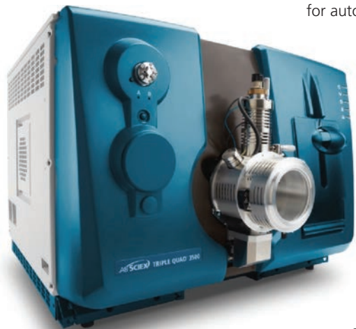
The AB Sciex Triple Quad™ 3500 System

The TripleTOF® 6600 system with SWATH™ Acquisition 2.0 designed for quantitative proteomics and biologics. This high-resolution, accurate-mass system, combined with the new SWATH™ Acquisition 2.0, is ideal for studying changes in biotherapeutics when combined with BioPharmaView software, this solution helps the researcher gain a rapid, accurate, and confident understanding of compounds in the area of drug development.