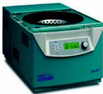
Figure 2. miVac DNA concentrator.

The miVac (Figure 2) dries by boiling the samples under vacuum. As the pressure in the system drops, so does the boiling point and therefore the temperature of the samples. Samples containing methanol will routinely boil at -20°C until they dry when they will warm up to the temperature of the system, typically not more than +40°C. The sample vials are spun in a centrifuge rotor during evaporation to prevent samples boiling over and any resultant sample loss and/or cross contamination. Vial holders can be custom made to accommodate the favoured vial size.