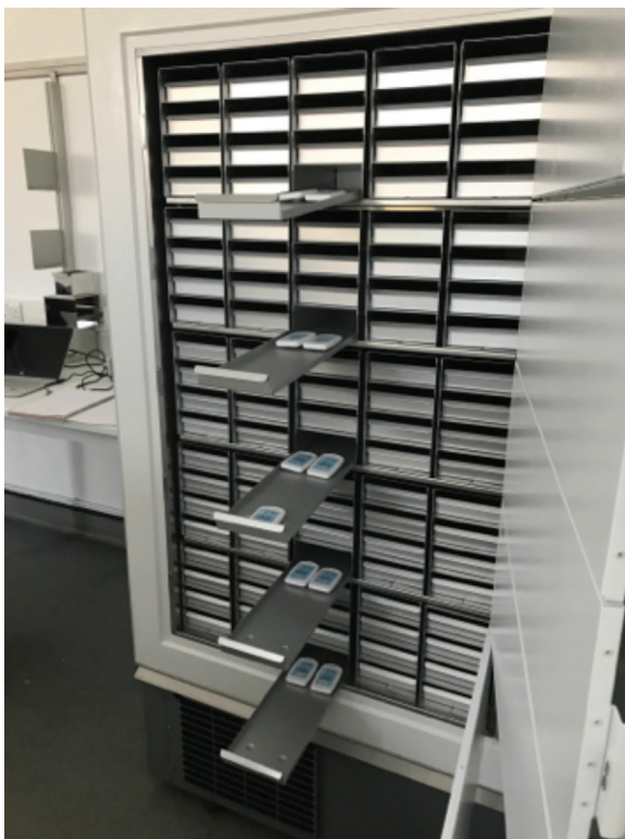
Figure 1. ULT freezer fully racked with temperature loggers in place.

The data was collected over a two week period at the Department of Plant Sciences, University of Oxford. The Eppendorf ULT freezer (F570h) tested was supplied for the study by Scientific Laboratory Supplies Ltd and the racking was supplied by Wesbart. The racking was made of aluminium in the format of front opening outers designed to house standard cryoboxes. The total weight of the aluminium racking used was 90kg. The unit was tested in an air conditioned laboratory where the ambient temperature was recorded at 19°C (+/-1°C). The ULT freezer had a temperature logger placed at the centre point of each of its shelf, with a further two loggers placed at the centre front and centre