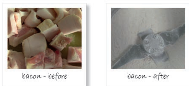
Figure 4: Bacon before and after grinding in the Knife Mill GRINDMIX GM 300

Medium sample volumes of up to 2 l with a feed size not bigger than 40 mm, such as 500 g wine gum, 250 g grapes, 400 g pure bacon or 800 g raisin, can be homogenised perfectly in the GM 300 by using dry ice snow as grinding aid. The use of LN 2 is not recommended as the mill is not designed for temperatures as low as -196°C. The sample is mixed with dry ice in a ratio of 1:2; after a few minutes, it is thoroughly cooled, and the grinding process starts. The dry ice keeps the sample cool all the time. Care should be taken not to use any plastic accessories when carrying out cryogenic grinding in the knife mills as these could be damaged during the process. Suitable accessories include a grinding container of stainless steel, a full metal knife and a lid with aperture to allow evaporation of the gaseous carbon dioxide.