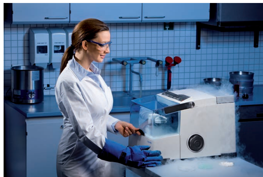
Figure 1. The CryoMill offers the advantage of continuous cooling of the grinding jar with LN 2

Sample volumes like a few gummy bears, some strips of chewing gum, a small piece of meat or small amounts of fatty spices are best homogenised in the MM 400. This ball mill is perfectly suited for homogenising sample volumes up to 2 x 20 ml in less than 1-2 minutes. It is important to fill the jar first with the grinding ball(s) and with the sample and close it tightly before embrittling. Care must be taken that no LN 2 is enclosed in the