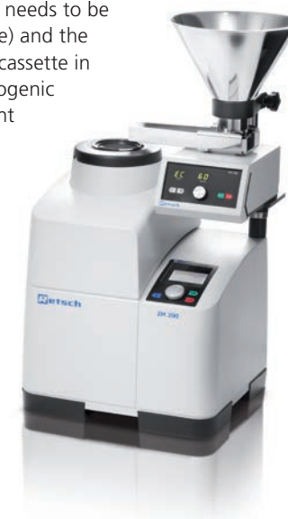
Figure 5: Ultra Centrifugal Mill ZM 200

The Ultra Centrifugal Mill ZM 200 accepts large sample volumes up to 4 l with a feed size < 10 mm, such as 100 g cereals, 150 g onions or 100 g dried apple pieces. The sample is directly immersed into a container filled with LN 2 before being continuously but slowly fed to the hopper of the mill with a steel spoon. When using dry ice as grinding aid, this needs to be mixed with the sample (1 part sample, 2 parts dry ice) and the entire mixture is then pulverised in the mill. Using a cassette in combination with a cyclone is recommended for cryogenic grinding to ensure that the evaporating cooling agent is completely discharged during the grinding process.