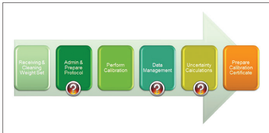
Figure 1. Manual process for weight calibration indicating steps with highest risk of error

Ongoing reliability for these custom systems may also be called into question for various reasons including low data security and the amount of training required for new personnel. Custom systems also typically lack an ability to interface with the comparator balances or other lab equipment. As such, the most significant source of error in any calibration process, manual data transcription, is not addressed or eliminated (Figure 1). If data is only stored on paper, statistical analysis and historical reporting becomes difficult if not impossible.