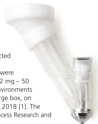
Figure 2: Quantos QH012-LNMP dosing head (2.5 mm diameter dosing pin with pushing stirrer and Pinocchio 1 mm nose, specifically designed for dispensing into small receptacles).

The ETC automated powder dispensing benchmarking study involved four commercially available standard platforms, including the Mettler Toledo Quantos system. Seven reference substances were carefully selected which represent the range of challenging physical characteristics typically encountered in a pharmaceutical laboratory. These substances have varying flowability, particle size and shape, density, and hygroscopicity properties. Over the course of the study, almost 18,000 data points were collected by the five participating companies, in order to assess the accuracy and speed of dispensing powder into vials. Tests were carried out on each instrument, with target weights from 2 mg – 80 mg for each powder, in a variety of different laboratory environments (fume hood, glove box, local exhaust ventilation (LEV), purge box, on open bench). Preliminary results were presented at Pittcon 2018 [1]. The full findings of this ETC study are published in Organic Process Research and Development [2].