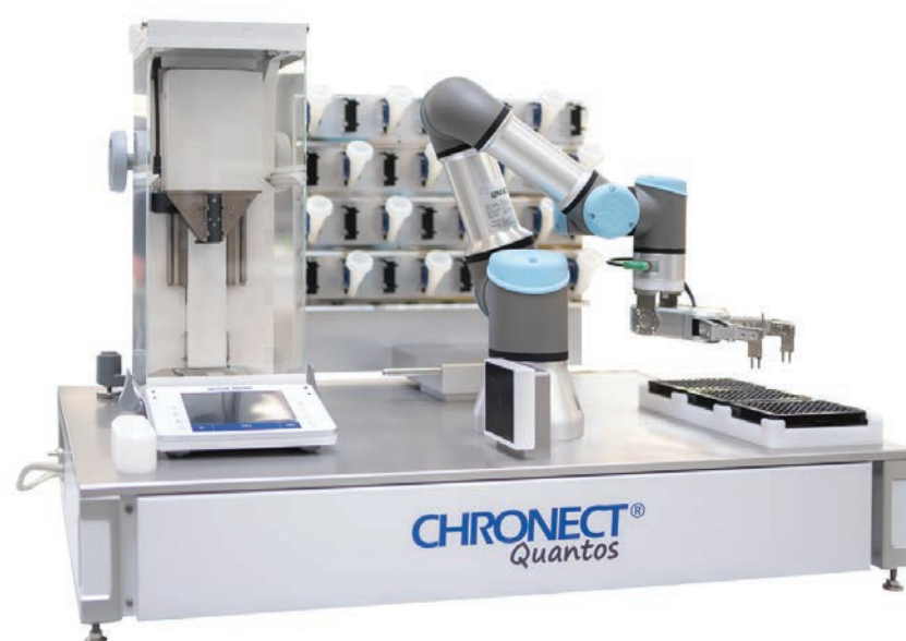
Figure 4: Chronect Quantos for many-to-many powder dispensing into 12 - 96 position plate formats.

One of the key requirements of many HTE workflows is the ability to dispense into 96 position plate formats. The most recent innovation in the Quantos powder dosing product portfolio now provides this capability. The fully automated CHRONECT Quantos platform combines the intrinsically accurate and efficient Quantos powder dispensing technology with a state-of-the-art 6-axis robotic arm, to achieve many-to-many powder dispensing operations into a range of vial sizes (Figure 4). Up to 32 different powder substances, each with a dedicated dosing head to avoid cross-contamination, can be accommodated on the CHRONECT Quantos platform at any one time. Dispensing can be performed into three 12 - 96 position format plates at a time, with a maximum capacity of 288 vials or tubes (1 ml volume, 6 mm diameter).