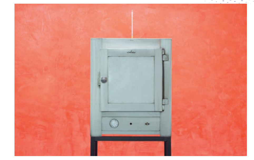
The cornerstone of the company's success: Aeolus

The company constantly strives to develop products which offer the highest level of efficiency and environmental compatibility. This, in turn, enables sustainable business practices for Memmert's customers too. Furthermore, this underlines the fact that Memmert is an absolute pioneer when it comes to sustainability.