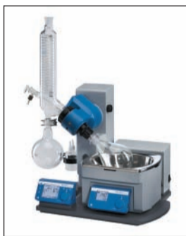
Figure 1: The RV 10 control tops off the RV 10 range from IKA, which comprises three rotary evaporators.

Until now, automatic distillation systems have predominantly been controlled by an automatic pump stand using differential pressure measurements. The new IKA system works on a different principle. Included in the RV 10 control is an infrared interface for bi-directional data transfer between the heating bath and the drive unit. This means that the heating bath can be moved to a safe position directly by the drive unit if a fault is detected. IKA has also