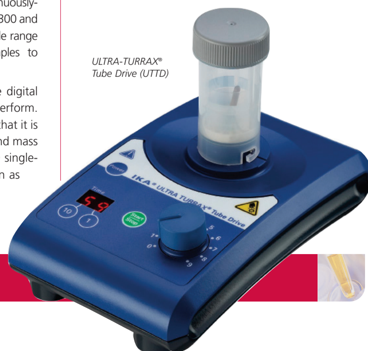
ULTRA-TURRAX® Tube Drive (UTTD)

The timer switch function that appears on the digital display makes jobs reproducible and quick to perform. The modular construction of the device means that it is equally well suited to individual analysis tasks and mass screening work. What's special about the UTTD single-use tube is that it is hermetically sealed as soon as the cover is closed.