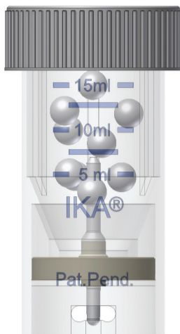
The new single-use tubes (BMT-20 shown here) form the basis of the UTDD single-use concept.

Small volumes of cells, in particular micro-organisms, can be triturated in a mortar with sand or Al_2O_3 , or using a glass-bead mill. Homogenisation using ultrasound is also possible, whereby the cells are destroyed by continually colliding against each other (cavitation forces). There are numerous disadvantages associated with these conventional methods. The use of reusable containers introduces the risk of cross-contamination, something that can only be avoided by intensive cleaning after every sample. This necessarily means an increase in the time taken for each task. Because most homogenisation takes place in open containers, laboratory employees are constantly exposed to the risk of contracting contagious illnesses (BSE, AIDS, tuberculosis) when working with infected tissues. The probes used for ultrasound homogenisation can become very hot, which can lead to samples being destroyed or chemically altered. Using mechanical equipment (Potter/mortar) for the trituration means that the method cannot be validated, since the time taken and degree of homogenisations are dependent on the operator. In addition, the laboratory employee loses a lot of time because every sample requires manual intervention. These problems can