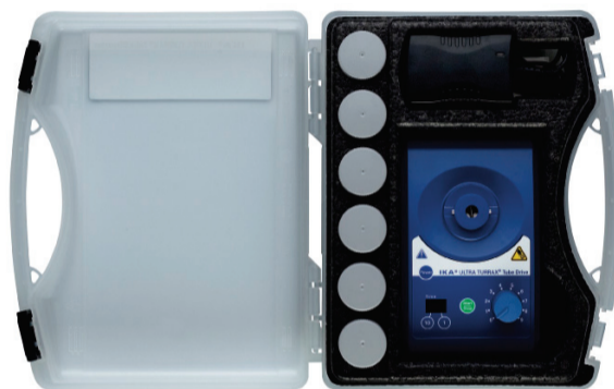
The UTTD Workstation comprises, in addition to the UTTD, two stirring tubes (ST-20), two dispersing tubes (DT-20), two ball-mill tubes with glass balls, two ball-mill tubes with stainless-steel balls, removal hooks for taking out the rotor-stator unit and a mains power supply.

The preparation of samples accounts for a large proportion of the time needed for most chemical analyses. Recent studies have shown that laboratory staff can spend as much as 55% of the overall time taken to perform an analysis just preparing samples properly.