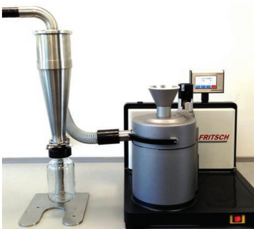
Figure 4. PULVERISETTE 14 premium line with stainless steel Cyclone Separator converted for the comminution of larger amounts

After comminution, the sample is therefore directly and precisely transferred into the collecting vessel. Due to the increased airflow the sample and grinding parts are additionally cooled and the temperature of the system remains constantly below 65°C [6] – the critical temperature for \beta -glucan.