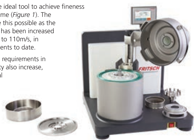
Figure 1. The Fritsch Variable Speed Rotor Mill PULVERISETTE 14 premium line

For analytical tasks the requirements in regards to homogeneity also increase, since modern analytical instruments need less and less sample material. With a constant initial volume, the analysed sample amount has to remain representative for the entire sample. This is only possible if the original sample is comminuted further.