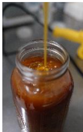
Figure 2. Cannabis oil

The producers of these cannabis oils naturally want to make the extraction process as efficient as possible. That means: the highest possible yield of the ingredients in the shortest possible time.