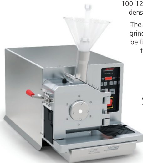
FRITSCH Universal Cutting Mill PULVERISETTE 19

In cooperation with OutCo, a cannabis producer in California, USA, we examined which degree of grinding means the optimum for the most efficient extraction [1]. The best results are achieved with the 2 mm sieve. Other screens can also be used for different fractions.