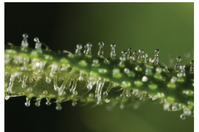
Figure 1. Sticky and Tricky – the translucent structures that are seen producing from the cannabis flower are trichomes. These structures are resinous & sticky and contain the vast majority of biologically active cannabinoid and terpene compounds. This is a challenging material for milling.

The cannabis active ingredients are used therapeutically in particular as pain reliever, for appetite stimulation, anti-inflammatory and antispasmodic.