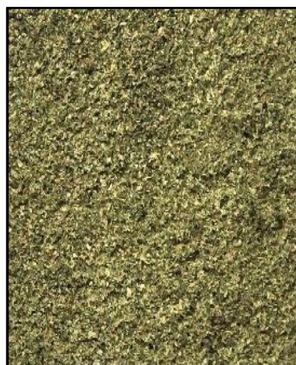
Figure 4. Homogeneous sample done with the FRITSCHE PULVERISETTE 19