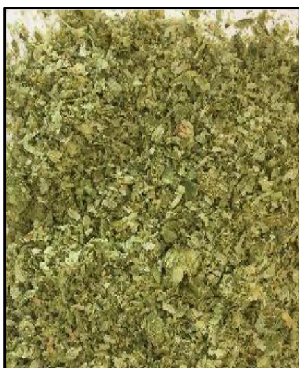
Figure 3. Inhomogeneous sample done by a food blender

The requirement for this is an optimal, homogeneous grinding of the cannabis plant. The instrument used in this study was the Fritsch PULVERISETTE 19 Universal Cutting Mill for fine grinding and for precise comminution.