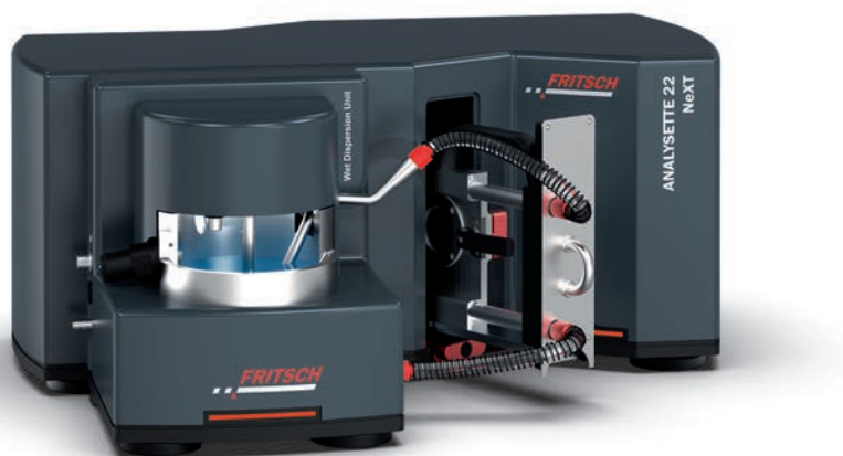
Figure 1: The ANALYSETTE 22 NeXT with the measuring cell pulled out.

Due to its ultramodern electronics, the core of which are extremely fast, high-resolution converters, the ANALYSETTE 22 NeXT acquires the signals of all detector elements simultaneously. It therefore always delivers the entire scattered light distribution at exactly the same time and transmits it to the software several hundred times per second.