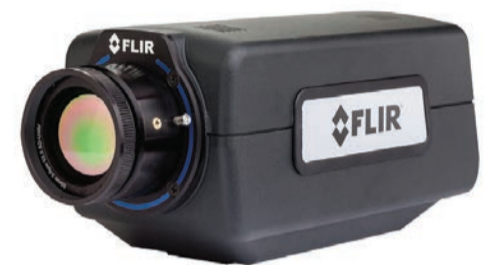
The FLIR A6750sc perfectly captures subtle temperature changes that are associated with human emotions such as stress.

Flying a helicopter is a stressful activity. Pilots have a high workload and are constantly under pressure. Italian helicopter manufacturer Leonardo wanted a reliable and objective way to measure the stress that pilots experience, so they would be able to design more functional cockpits and train helicopter pilots more efficiently. The company brought in high-end thermal cameras to monitor pilots during flight simulations and to exactly see which procedures and operations cause stress.