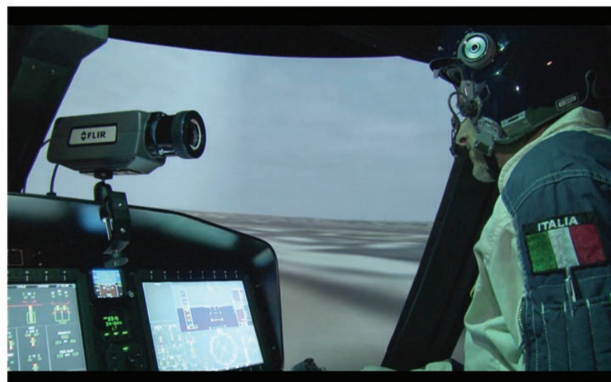
The ISMS helps Leonardo understand stress imposed on pilots during missions, either in simulators or in real missions.

The ISMS helps Leonardo understand the stress imposed on pilots during missions, either in simulators or in real missions. This technology has different applications. First of all, it enables Leonardo to test and verify cockpit human machine interfaces (HMI) in an early stage and helps them to discover how information or commands should be presented