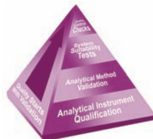
Figure 1. The pyramidal interdependency fundamental to quality management system operations within a laboratory

Laboratory processes are increasingly evaluated during a regulatory audit through a systems-based approach. Figure 1 illustrates the pyramidal interdependency fundamental to quality management system operations within a laboratory. Each layer adds to the overall quality, with AIQ as the foundation. Attempting to rely only on "system suitability" or