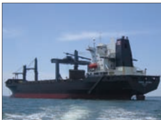
Figure 2. Swire Shipping's MV Pacific Celebes off Thailand in May 2007