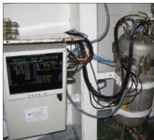
Figure 3. The SNOMS sensor tank and data logging unit in the machinery space of the MV Pacific Celebes