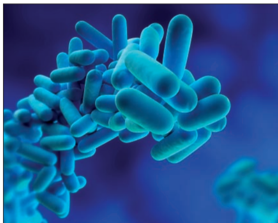
3D model of L. pneumophila .