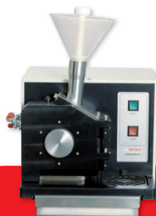
PULVERISETTE 19 – THE POWERFUL FRITSCH UNIVERSAL CUTTING MILL

Only possible with FRITSCH Cutting Mills: The complete grinding chamber can be completely emptied with only 2 motions and this without tools – for an unrivalled fast, efficient cleaning. And that is just one of its many advantages!