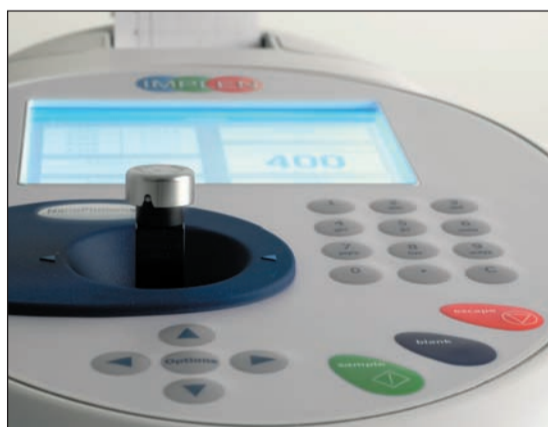
Figure 1. The NanoPhotometer™ incorporates a simple menu driven user interface. The system is operational within 30 seconds and a typical analysis time is 5 seconds.

In a recent study, by the National Centre for Forensic Science at the University of Central Florida, a previously unidentified wavelength effect which shows a significant relationship to the life time of a blood stain has been discovered. The degree of this wavelength effect allows for more accurate determination of the time since the blood was deposited and it is now possible to differentiate between stains that were deposited minutes, hours, days and months ago. Using the NanoPhotometer™ from Implen the team at the National Center for Forensic Science established that tiny bloodstains of only 1µl could be used for this investigation. One of the benefits of the NanoPhotometer™ is that it is portable and therefore may be taken to the crime scene to first of all confirm that the stain was blood and then to determine how long it had been there. The instrument is perfectly optimised for this forensic application as it may operate from a 12V DC supply if required, has no moving parts for in-field reliability, does not require regular servicing or calibration and requires very little operator training plus of course it provides high performance on low sample volumes (Figure 1).