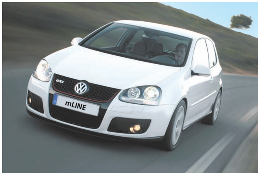
Figure 4. The latest VW Golf GTI