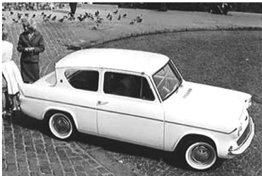
Figure 3. 1970 Ford Anglia 105E

It is not difficult to determine which is the best tool for the job. We do understand that other more onerous or complex forces may be at work that prohibit the free purchase of your Gti, but it may well make sense even in this case to canvass for your own emergency products when the repetitive tasks become too much. It may also be wise to educate the system and illustrate the dangers of poor pipetting (and RSI) to administrative personnel.