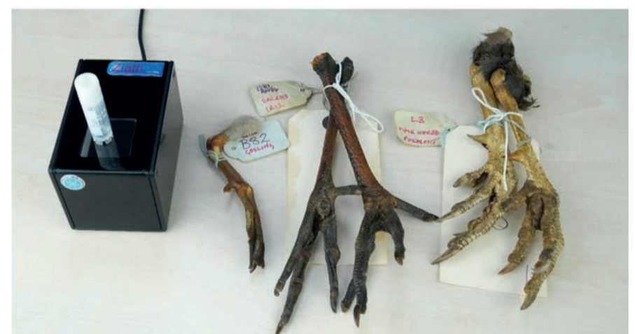
An effective sample management solution to catalogue the archives.

Ziath are providing ZSL with 2-D barcoded tubes and its Single Tube barcode reader which will be used in conjunction with Ziath Samples software. The technology will enable the team to quickly and easily retrieve samples from the collection when requested by researchers.