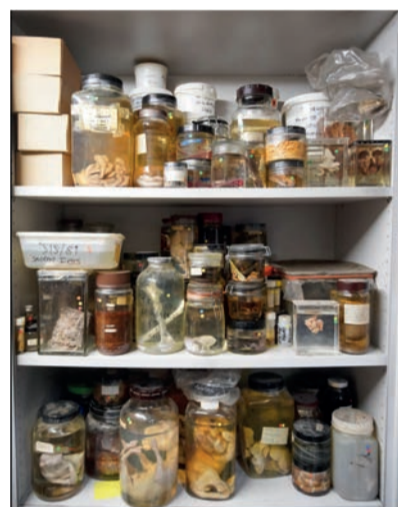
A collection of samples down in the archives.