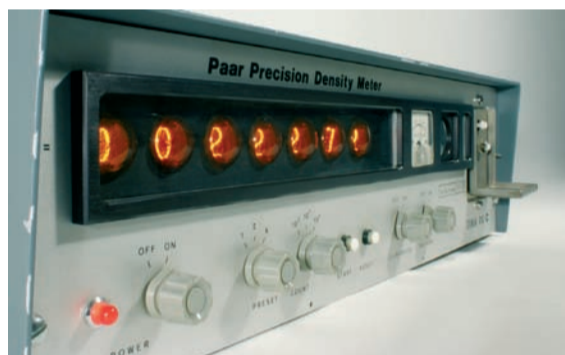
Figure 1. The first digital density meter: DMA 02

In the 1960s, density measurement entered the digital era when an Austrian company, Anton Paar GmbH, launched the first digital density meters. These instruments, using a new measuring principle which was groundbreaking at the time, have since revolutionized density measuring practice and tens of thousands of density meters are now in use worldwide.