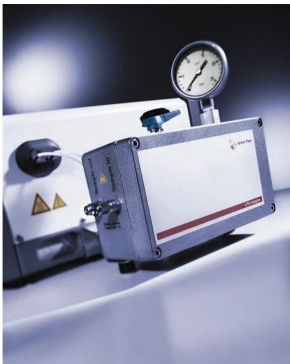
Figure 4. Density measurement of liquefied petroleum gas

Filling the petroleum samples is an issue which may require additional apparatus. Samples with low viscosities can usually be measured directly. The sample temperature is controlled by an integrated Peltier thermostat and the measurement is carried out at a temperature between 0 and +90 °C (32 to 194 °F). However, samples with high viscosities (e.g. up to 35,000 mPa.s) or samples with volatile components are best filled into the density meter under pressure. This is only available with high-end sample changers. Some sample filling systems also allow multiple measurements from the same vial and recovery of the sample. Measurement is completed within 1 to 4 minutes and the amount of sample required is low (typically 1 mL).