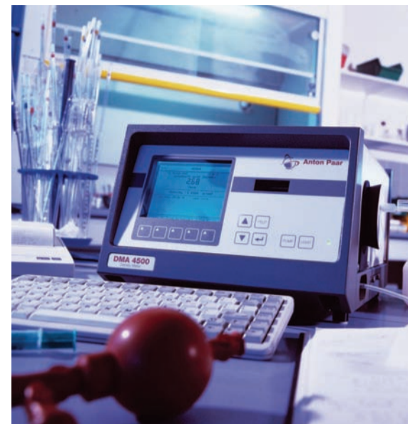
Figure 5. The DMA 4500 density meter

Digital meters can also be found in use in the production of essential oils and food flavourings. Measurement of the specific gravity of starting or gain materials and finished products is required to maintain a constant quality of the products. If the product is alcohol-based, such as essences and extracts, digital density meters can also be routinely used to measure the alcohol content via the distillate gravity. This is then converted to %alc, v/v or w/w using built-in tables in the meter. Sometimes, knowledge of both the density and refractive index is elemental for identifying or characterising the samples in which case a refractometer/density meter pairing can be used. In the case of density measurement alone, the required sample volume is typically 1 mL, simultaneous density and refractive index measurement requires approximately 2 mL when filled manually or 5 mL when using a sample handling apparatus.