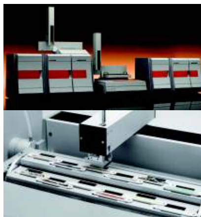
Figure 1. a) The elemental analysis systems of the multi EA® series. b) Solid autosampler FPG 48.