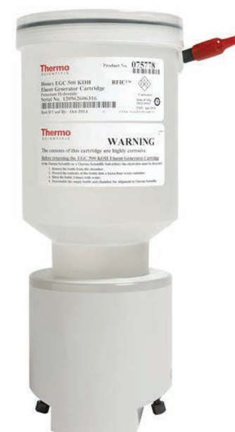
Figure 2. Thermo Scientific Dionex EGC-500 cartridge.

RFIC-EG systems have redefined ion chromatography by making it possible to just add water to completely operate an IC. This system allows for a simpler and more reliable way to help deliver superior results while simultaneously saving time and labour.