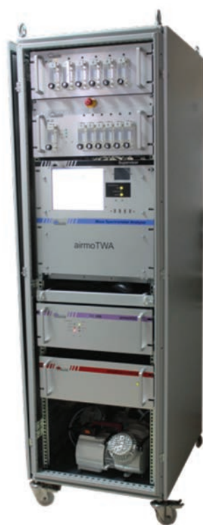
Figure 1: airmoTWA analytical system

A Chromatography Data System is vital for efficient and reliable operation of any modern on-line and continuous chromatography acquisition system. VistaMS, which has been developed at Chromatotec®, offers a unique solution for simple continuous identification and quantification of molecules from complex samples and data transfer of your system analyses. This software, included in all Chromatotec® MS systems, can intercompare and validate results obtained using multiple detectors. In ambient air systems, data from two FIDs and one MS are timestamped, saved and analysed to provide the most reliable and precise results. Analytical results can be easily re-processed changing all parameters of the TD-GC-MS-FID system (retention times, response factors, volume sampled, etc.). Automatic communication with NIST library allows for confirmation of identification of complex samples. Physical parameters of the TDGC and MS as well as all analytical results can be transferred using Modbus protocol.