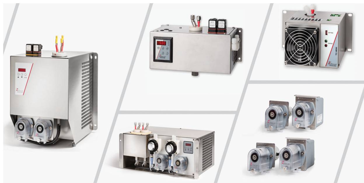
1: Pumps with PTFE bellows also safely transport sample gas with condensate to the analyser if the process pressure is insufficient or the response time needs to be reduced.

The second important criterion in choosing a pump is the application. If the pump is to be installed in a safe area and furthermore used to pump non-explosive gas, the choice of model is vast. There are far more restrictions when it comes to choosing pumps to be used in explosive areas. However, the options of suitable pump models with the relevant approvals are still vast. Bühler Technologies offer their own special pumps; the C-versions in several model ranges, are also suitable for transporting