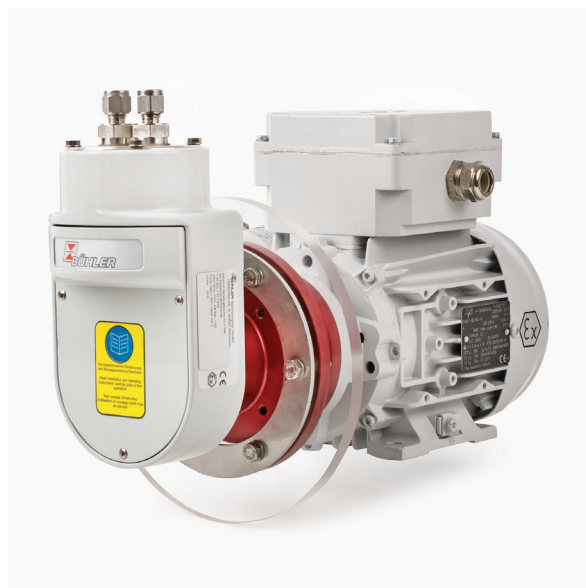
3: On version with separate drive, as the P2.4 ATEX here, the pump head can be installed inside the heated analysis cabinet with the motor remaining outside the cabinet.

Buehler sample gas pumps are extremely durable and robust. Kleineberg states: "Our pumps are often used for ten, some even for 15 years and longer." Of course they require proper maintenance, but in the case of bellows pumps, this is essentially limited to the bellow and pump valves. These need to be inspected routinely and replaced as and when necessary. For ATEX rated pumps the maintenance schedule, with the specified