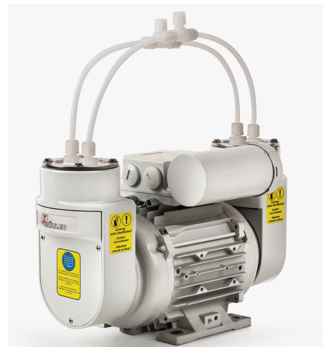
4: The largest model, the P4.83 sample gas pump, is intended for applications requiring a very high flow rate – or if two separate gas paths with 800 NI/h are desired.