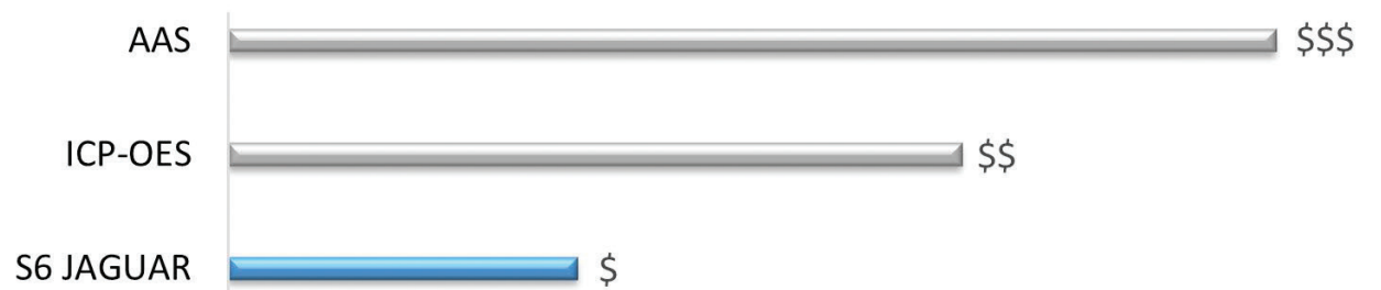
Figure 4: Relative estimation of operation costs. The consumption of chemicals (AAS, ICP-OES), expensive accessories (AAS) and noble gas (ICP-OES) results in much higher costs per sample for AAS and ICP-OES analyses when compared to XRF.

Engine and lubricating oils are inevitable for most motors and engines, ensuring proper performance and lifetime. Lubricating oils can be tuned to perfection for specific applications and engines.