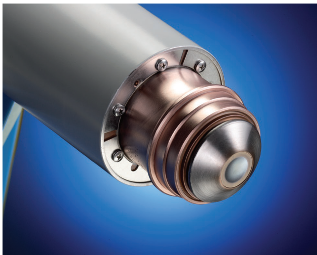
Figure 1: Powerful 400 W HighSense™ X-ray tube.