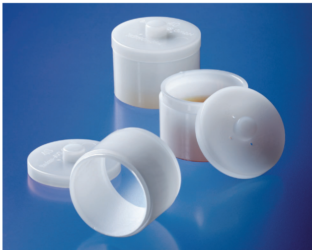
Figure 2: Dedicated liquid cups for lubricant oils.